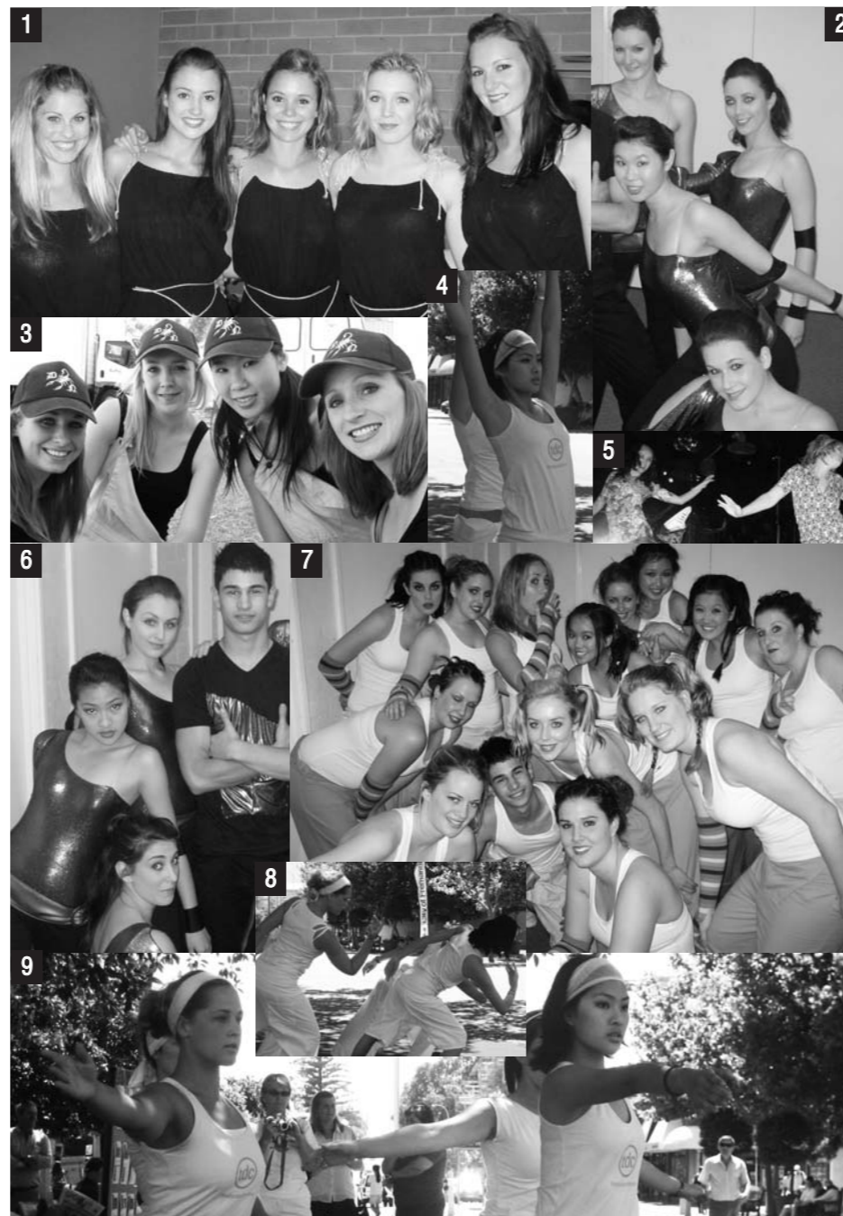
1 - Oasis Ball (Studio 54 Theme), Perth Convention Centre Ballroom, Perth; 2 & 6 - Showcase National Dance Championships, Swan Park Theatre, Midland; 3 - Perth South Technical College (Media Launch), Maddington; 4, 8 & 9 - Fremantle Festival, Market Square, Fremantle; 5 - Starlight Foundation Young Committee Members 70's Fundraiser, Under The Sea, Subiaco.